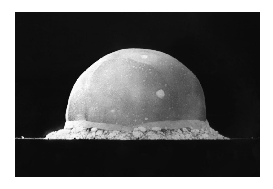
Trinity test site, 16ms after initiation