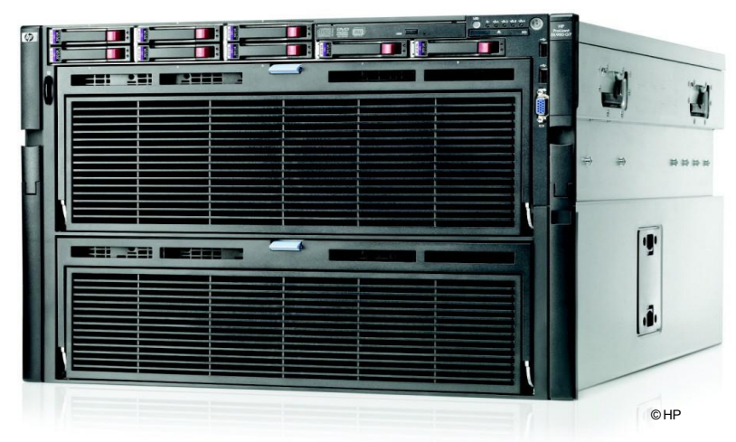
HP DL980 w/ 12 TB RAM